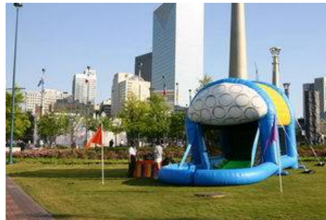
Adrenaline Rush Obstacle Course